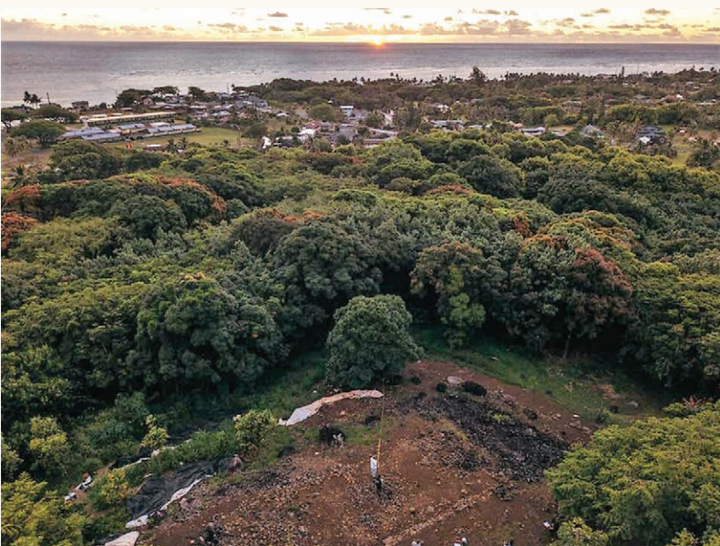
Sunrise over Maunawila Heiau Complex