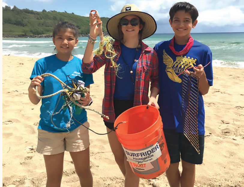
Keiki cleaning marine debris at HILT's Kāhili Beach Preserve