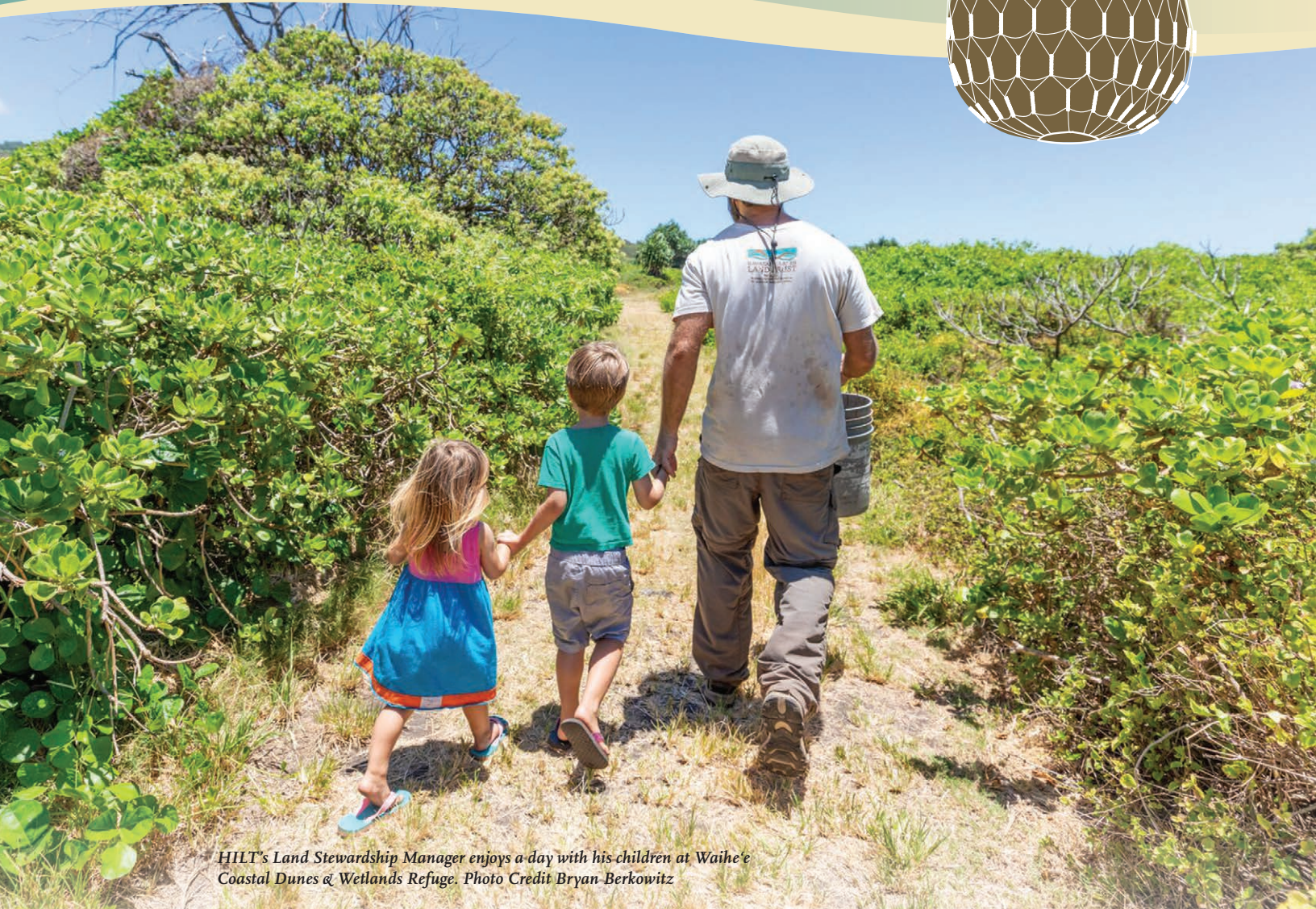
HILT's Land Stewardship Manager enjoys a day with his children at Waihe'e Coastal Dunes & Wetlands Refuge.