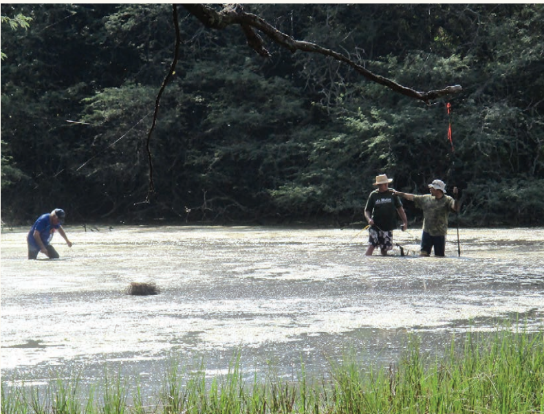
Paleoecology research at HILT's Nu'u Refuge