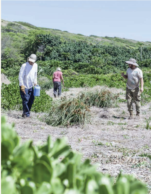
Volunteers work with HILT's Land Stewardship Manager to care for native plantings at HILT's Waihe'e Coastal Dunes & Wetlands Refuge

AmazonSmile Foundation Aldrich Family Charitable Gift Fund Alexander & Baldwin, Inc American Online Giving Foundation Anne & Jacob Starr Foundation Annie Sinclair Knudsen Memorial Fund Atherton Family Foundation Bendon Family Foundation Caruthers Family Foundation Charles Engelhard Foundation DonateWell Dorrance Family Foundation Echo Bay Foundation Edmund C. Olson Trust No. 2 Elaine and Robert Lang Foundation, Inc. First Hawaiian Bank Foundation Hawaii Community Foundation Hawaii Life Charitable Fund Herbert O. Wolfe Foundation Historic Hawaii Foundation Jewish Communal Fund Jewish Community Federation & Endowment Fund Koaniani Fund of the Hawaii Community Foundation Lyon Foundation, Inc. Makana Aloha Foundation Marin Community Foundation Morgan Stanley Foundation Ohuokalani Charitable Saunders Family Charitable Foundation Seattle Foundation Silva/Weiss Family Foundation Teach A Man To Fish Foundation The Cades Foundation The Davidow Family Foundation The Freeman Foundation The Jonathan Starr Foundation, Inc. The Joseph & Vera Long Foundation The Maccarone Family Fund The Red Cabin Foundation Trust The Vivian Marita Green Trust Traut Carson Fund Ulupono Initiative Watumull Stores/Jhamandas Watumull Fund Wilson Family Trust