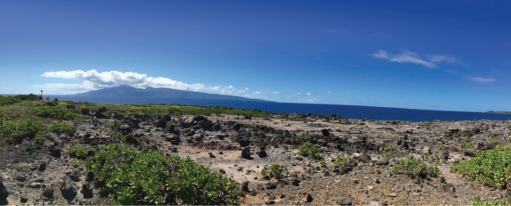
(Above) Hawea Point, HILT's easement off the Kapalua Coastal Trail, Maui.