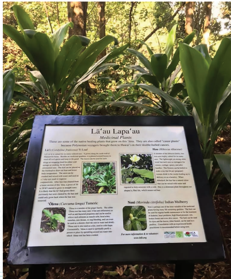
New educational signage at Maunawila Heiau, Hau'ula, O'ahu.

We are excited to move forward this year with an agricultural easement protecting 21 acres of MA'O Organic Farms in Wai'anae and expanding their organic farm and youth empowerment programming. We continue to work with the Pacific American Foundation to protect the Waikalua Loko I'a. This traditional fishpond, dating back to the 1600's, is an incredible cultural and ecological resource for our community.