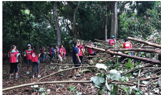
School children at Maunawila Heiau, Hau'ula, O'ahu.