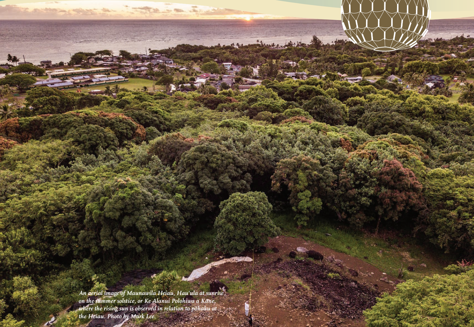
An aerial image of Maunawila Heiau, Hau'ula at sunrise on the summer solstice, or Ke Alanui Polohiwa a Kāne, where the rising sun is observed in relation to pōhaku at the Heiau.