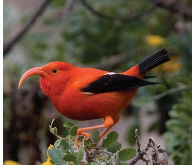
'i'iwi on 'ōhi'a.

HILT is also exploring ways to further support the protection of the North Kohala coastline makai of Akoni Pule Highway. This coastal area contains some of the most significant and well-preserved historical and cultural sites in all of Hawai'i. The North Kohala community has been successful in protecting several important sites along the coast and we hope to continue this collective effort to preserve Hawai'i's precious remaining natural and cultural treasures.