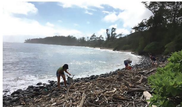
Volunteers clear the shoreline at Waihe'e Coastal Dunes and Wetlands Refuge, Maui.