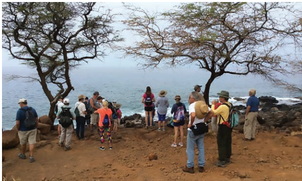
A Talk Story on the Land gathering at Kaiholena, Kohala, Hawaii'i Island.